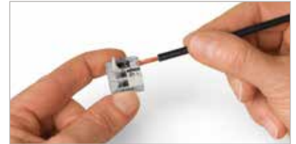
Easily open the lever by hand and insert a conductor.