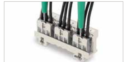
Easily test inserted connectors in the carrier.