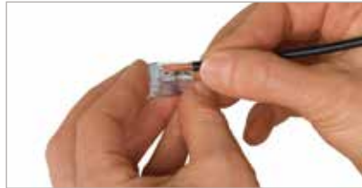
Strip conductor to 11 mm.