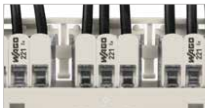
Rated 440 V with spacing between the adjacent connectors.