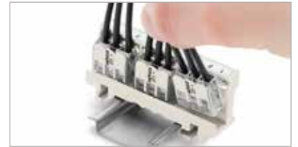
Easily install a connector into the mounting carrier.