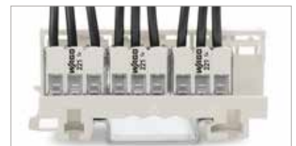
Rated 275 V with no spacing.