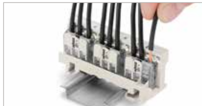
Simply connect and re-wire inserted connectors in the carrier.