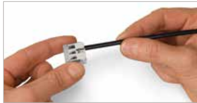
Push lever back down.