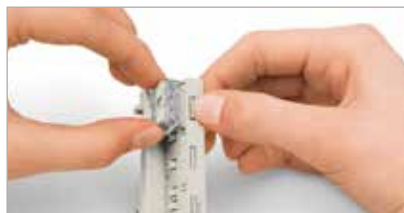
Easily remove the connectors – without tools.