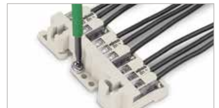
Secure the carrier using screws on smooth surfaces.